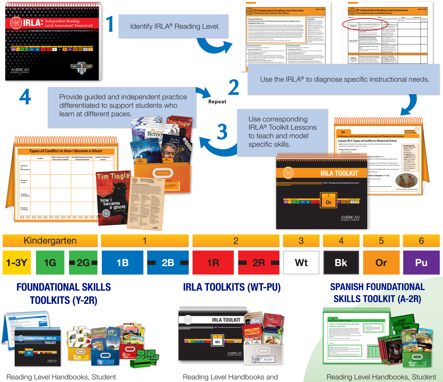
Facing Games and Supports, Practice Books and/or Small-Group Texts